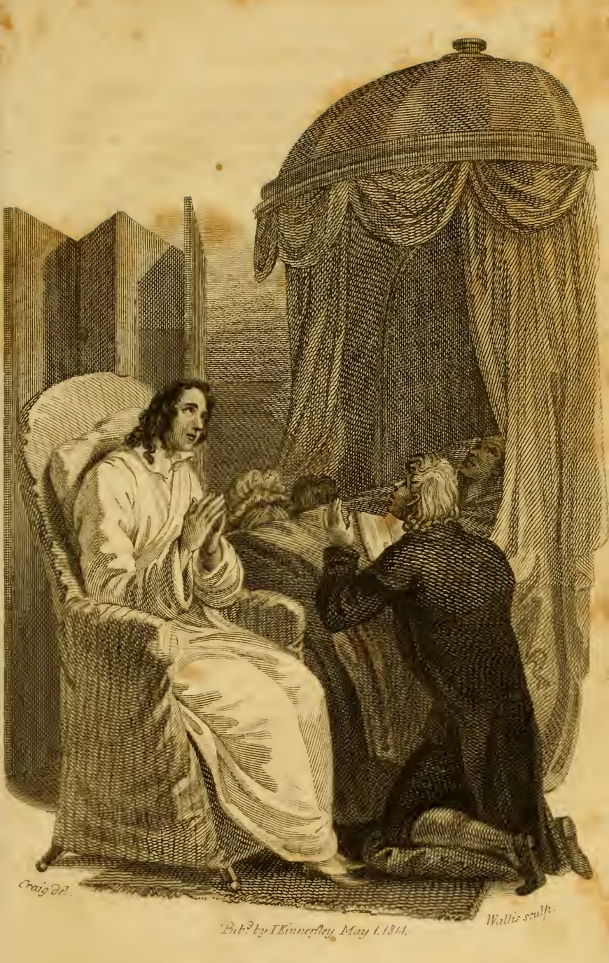
"O Death! how terrible is thy Approach."